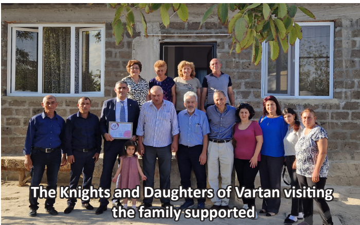
The Knights and Daughters of Vartan visiting the family supported