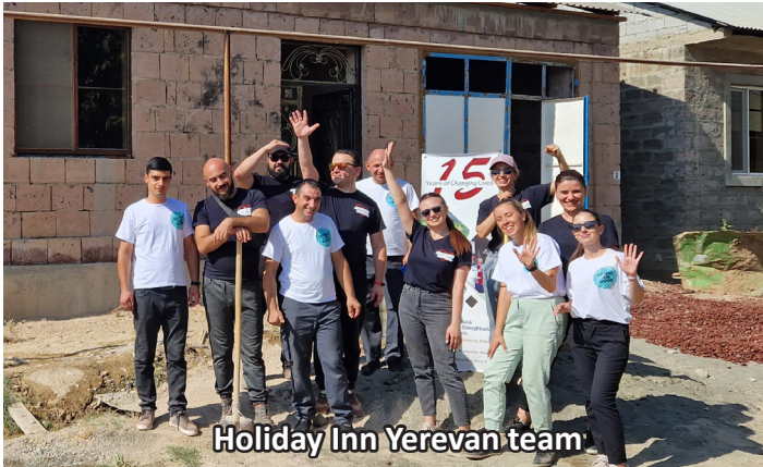
Holiday Inn Yerevan team