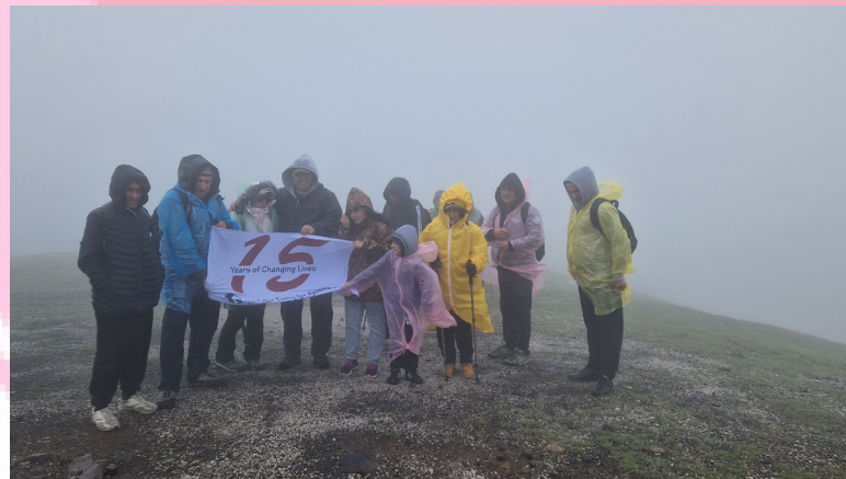
#Peak 5_ Mount Armaghan