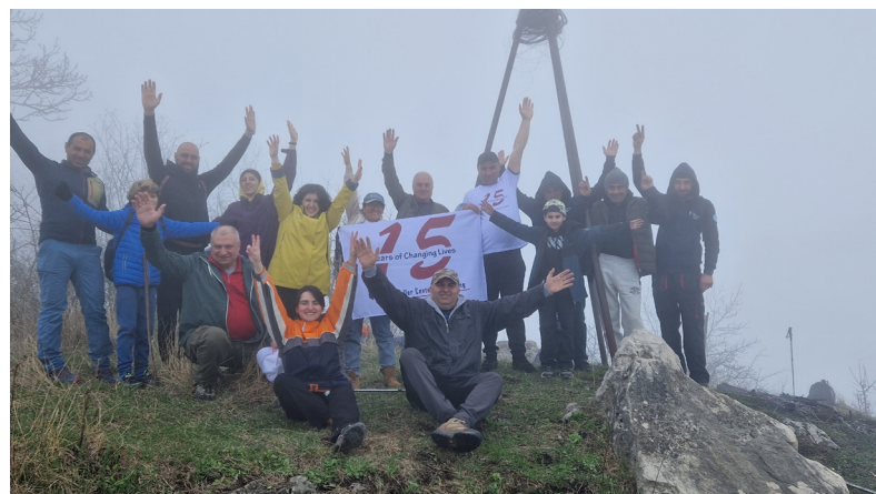
#Peak 1 _ Mount Tesilk