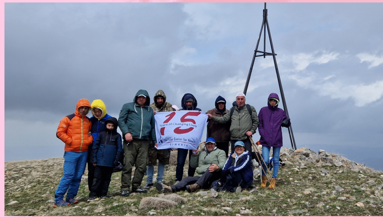
#Peak 3_ Mount Urts