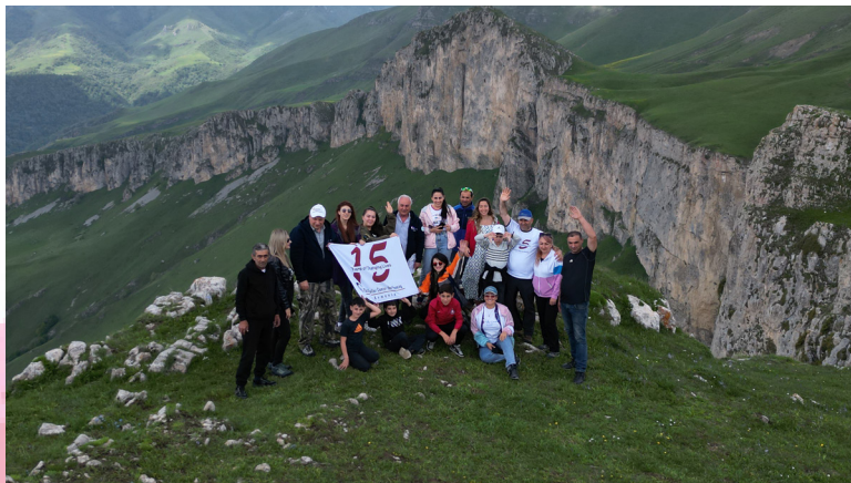
#Peak 6_ Mount Dimats