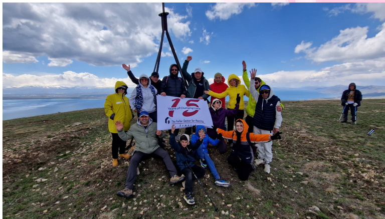
#Peak 4_ Mount Artanish