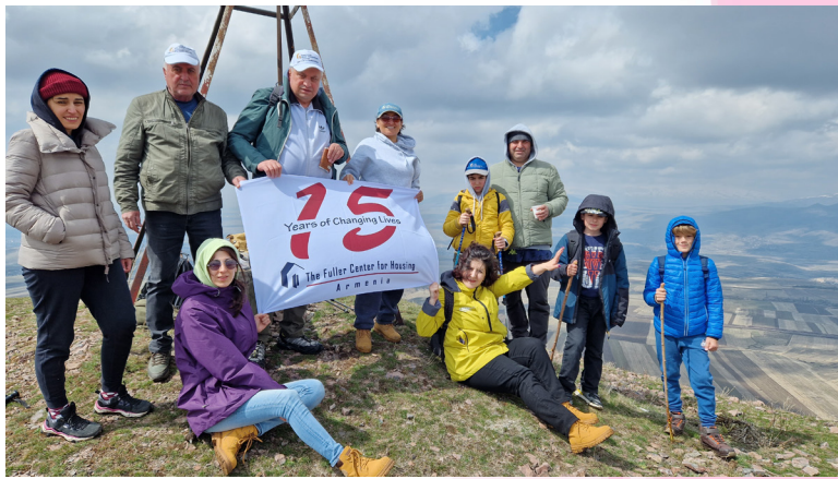
#Peak 2_ Mount Gutanasar