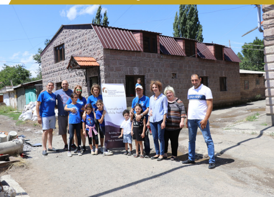
Homenetmen Glendale Ararat Chapter Scouts

When we get our hands together we make the impossible! These teams dedicated their time and efforts for more families to live in decent housing!