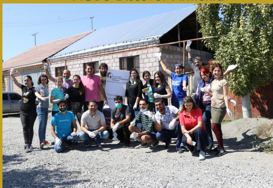
Teach for Armenia