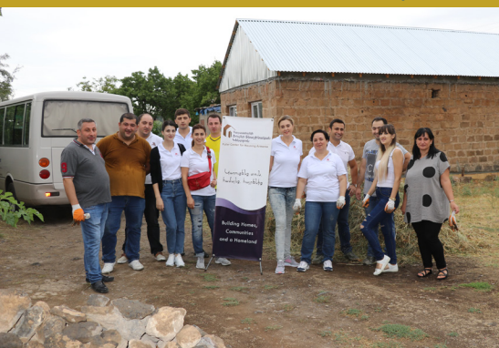
Armenia Marriott Hotel Yerevan