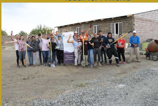
U.S. Embassy Yerevan