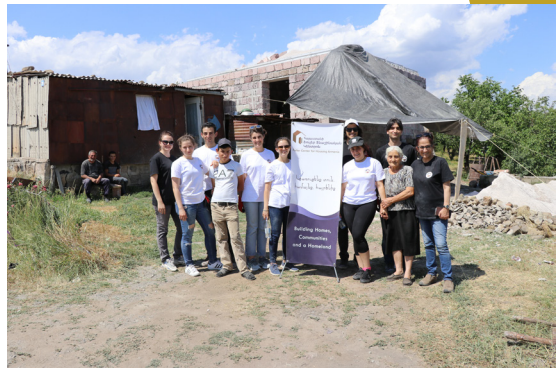
Armenian Assembly of America