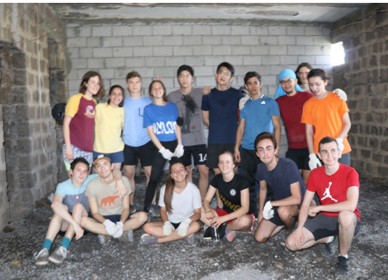
UWC Dilijan College