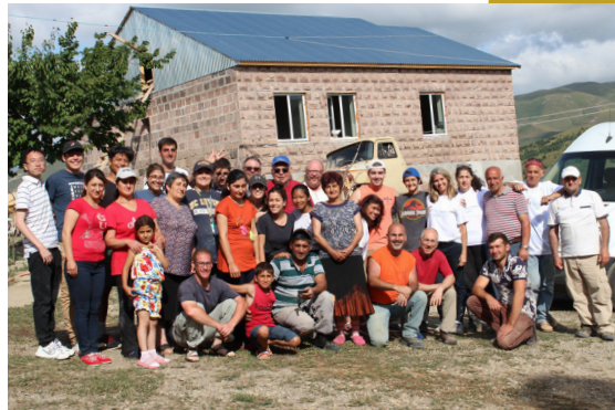
Engineer Armenia Program Team