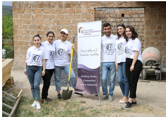
Best Western Congress Hotel Yerevan