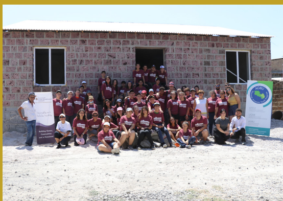
AGBU Discover Armenia